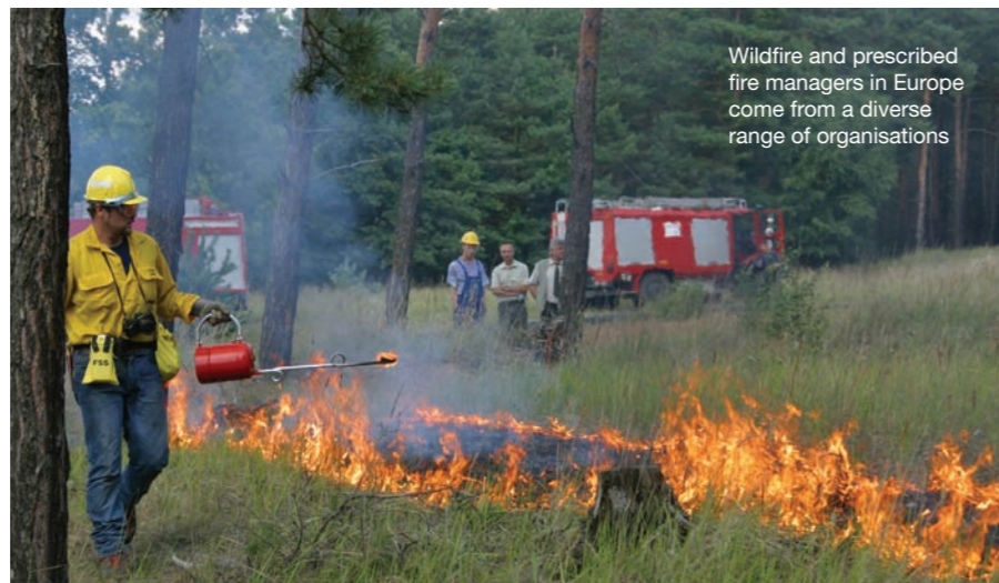
Wildfire and prescribed fire managers in Europe come from a diverse range of organisations

EuroFire is being funded with support from the European Commission. The information presented here reflects the views only of the author and the Commission cannot be held responsible for any use which may be made of the information contained therein.